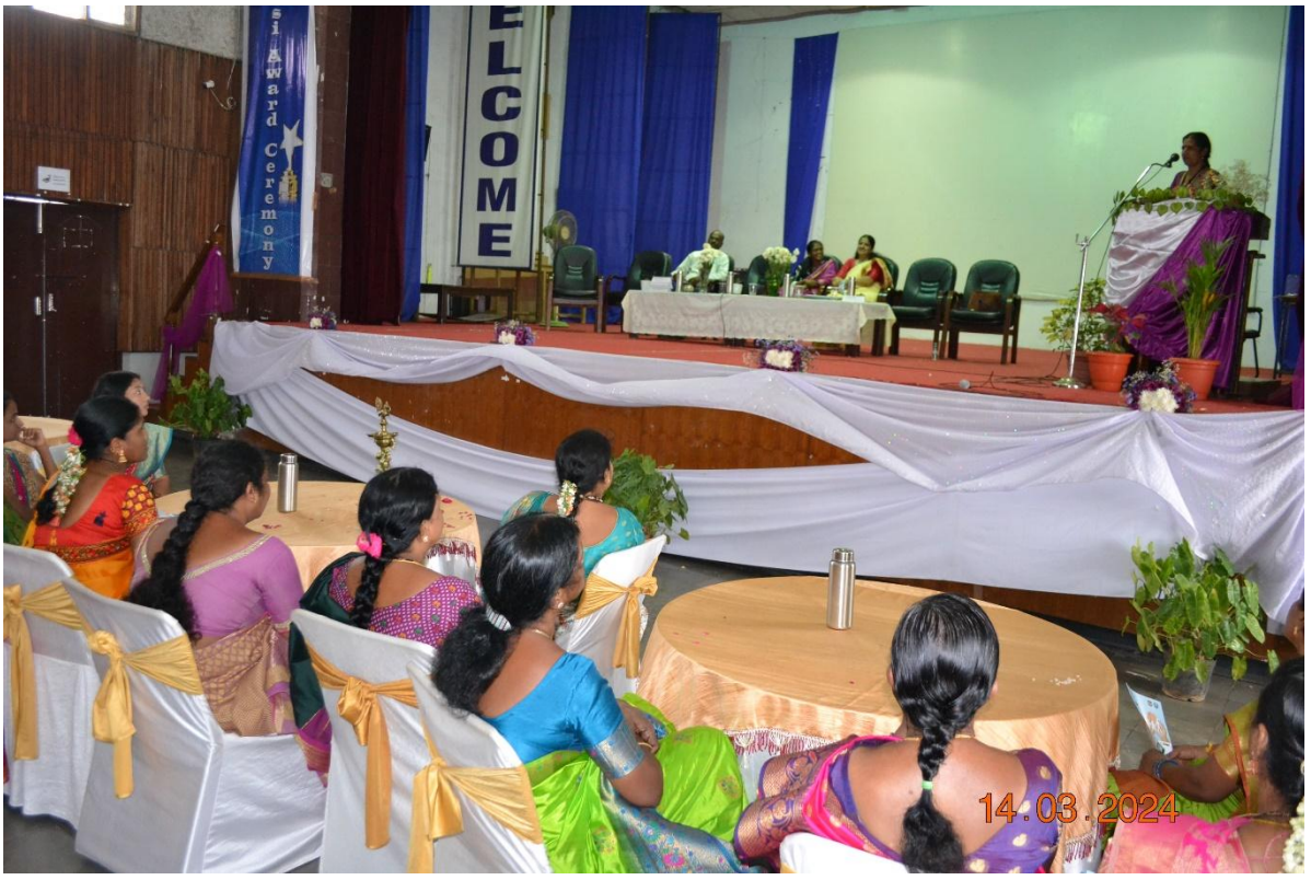
Panel Discussion (1:30 - 3:00 PM):