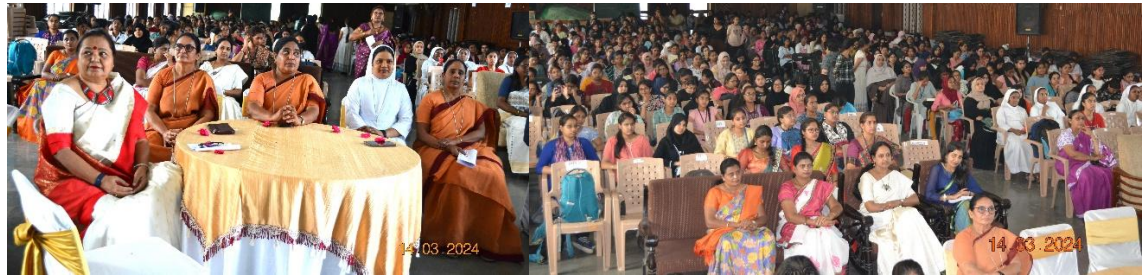
The inauguration was concluded with National Anthem.