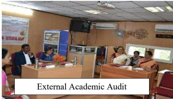
External Academic Audit