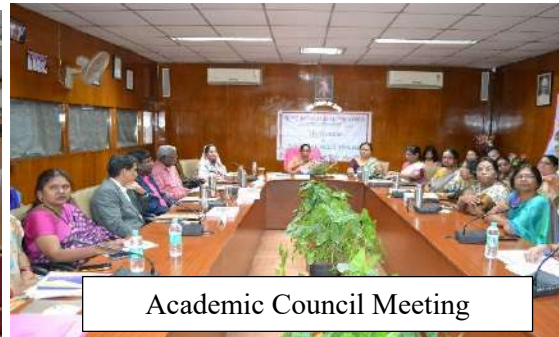
Academic Council Meeting