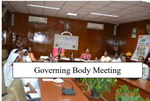
Governing Body Meeting