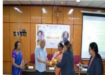
National Seminar on Digital Teaching- Learning strategies: Advances and Challenges in collaboration sponsored by TSCHE