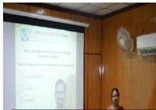
Seminar on Effective Communication Skills in collaboration with Dept. of English