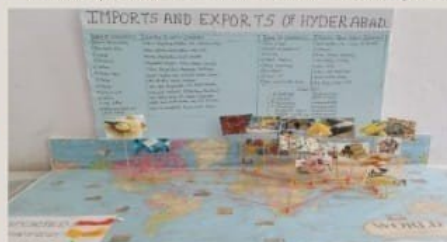
B.Com Foreign Trade students