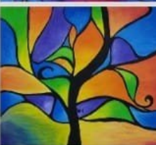
Deepika B.Com 1E