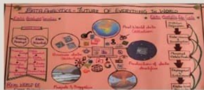
B.Com 1st year students