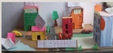
B.Com BPM 2nd year