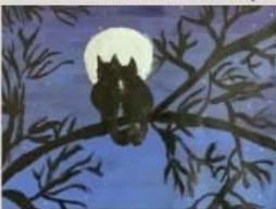
Tanuja B.Com 1E