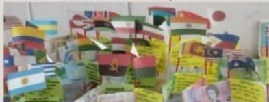
B.Com Foreign Trade 1st year