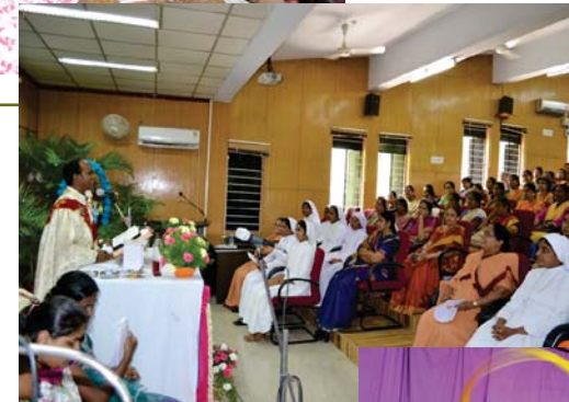
26th July The Feast Day of St. Anne