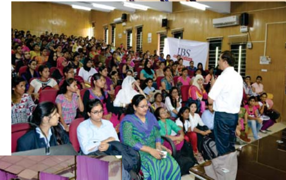
Placement in Progress