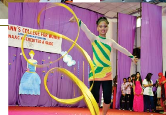
fresh display of Talent....