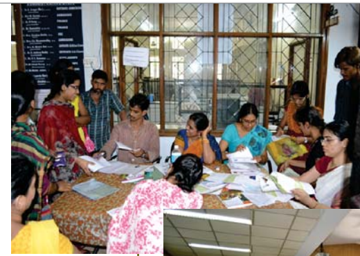
Admissions in full swing...