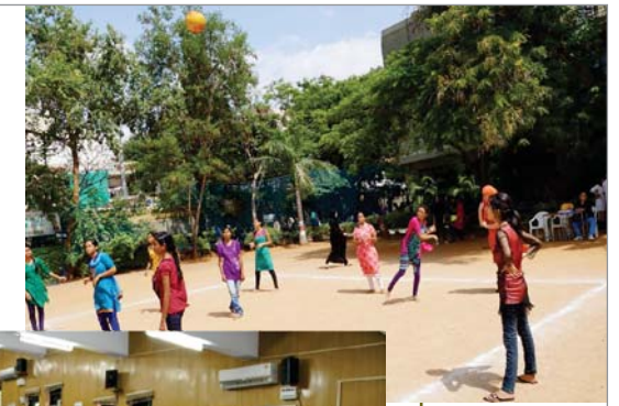
Inter Class Throw Ball Tournament