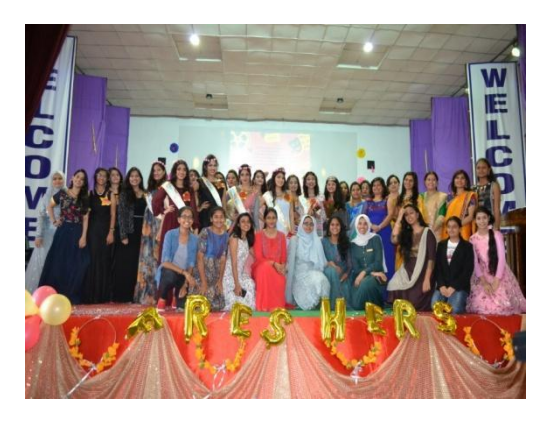
Cultural Committee abd SQAC Team