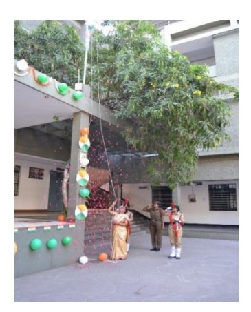
Flag Hoisting followed by Republic day Parade by our Proud NCC Cadets