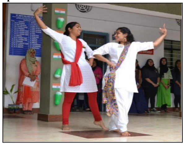
Students performing on Patriotic song