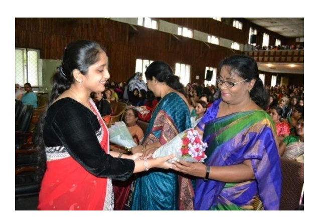
Floral greetings to the Deans