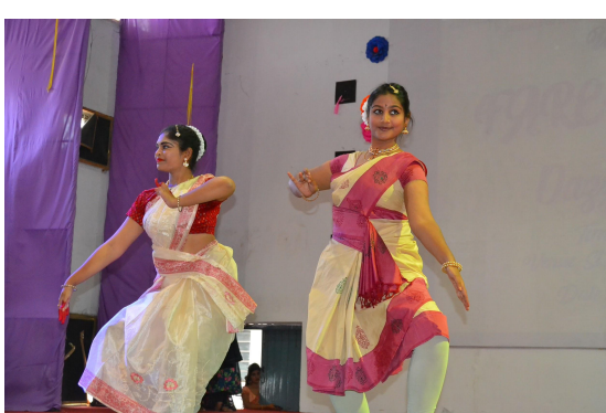
Classical Performance by Students