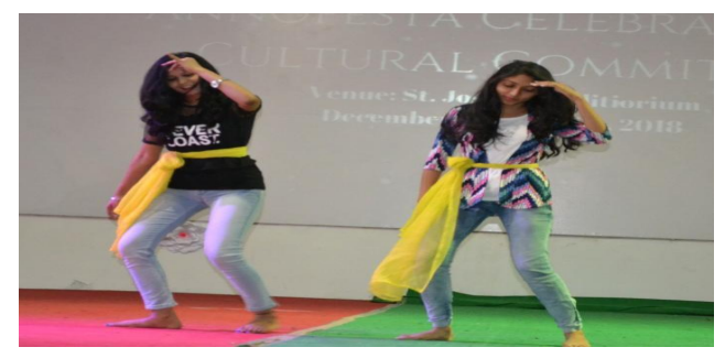
Folk dance by the Participants