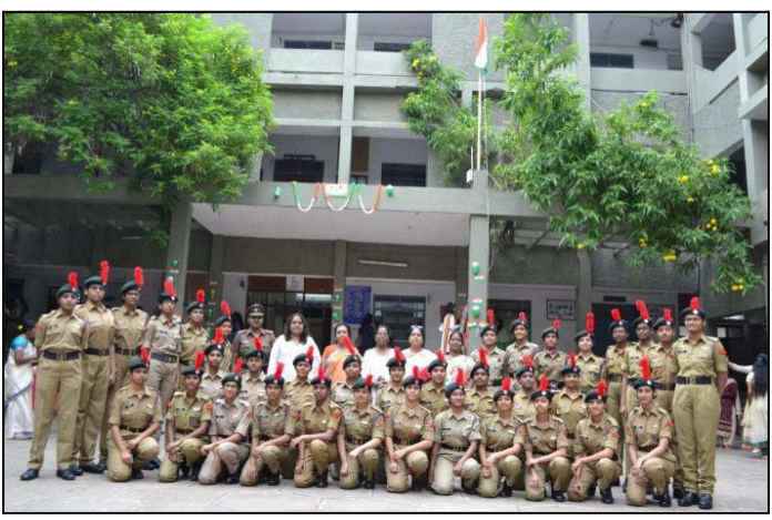
NCC Cadets with the Faculty