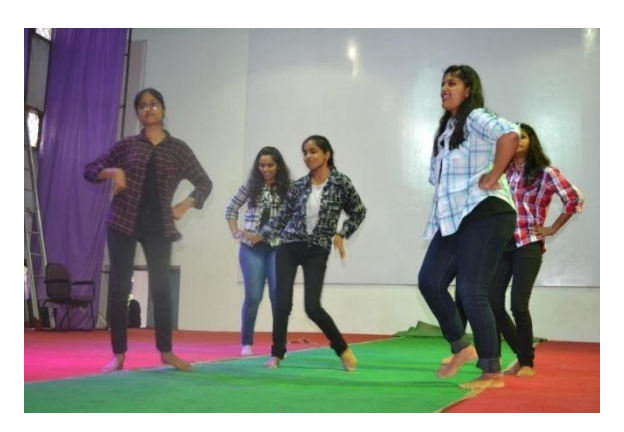
Dance by Hexops