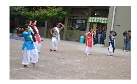
students entertaining the guest with their performance

Event: Republic Day Date: 26-01-2019 Brief Report