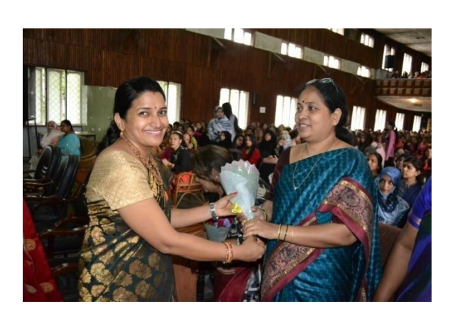
Floral greetings to the Deans