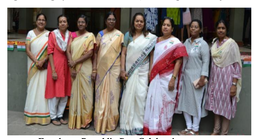
Faculty at Republic Day Celebrations