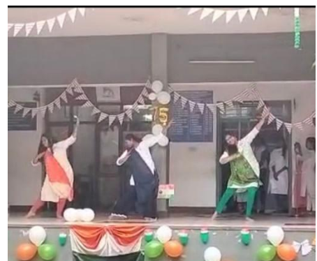
Republic Day Celebrations