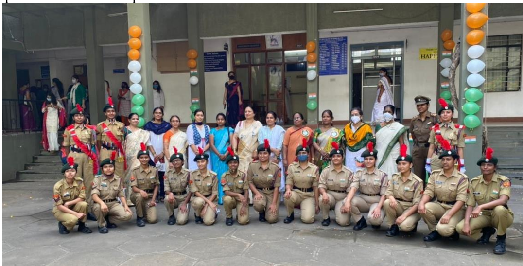
75 th Independence day Celebrations