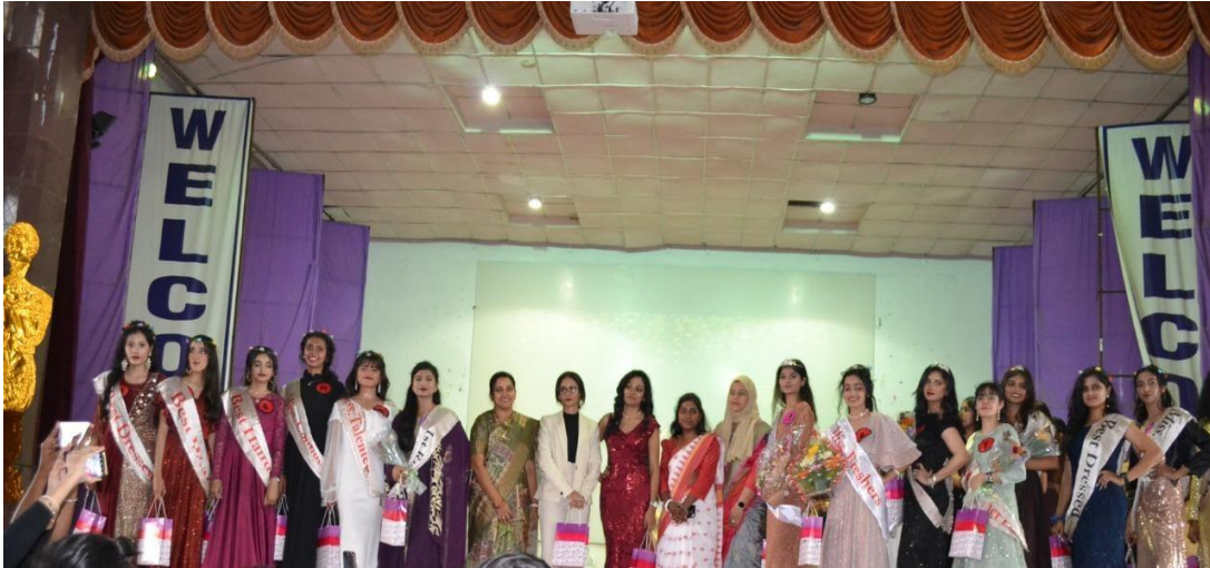
More talented and smart contestants of fresher's party