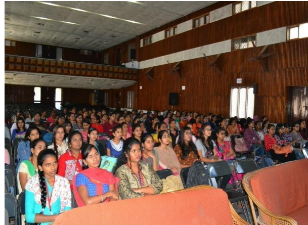
Teach for India