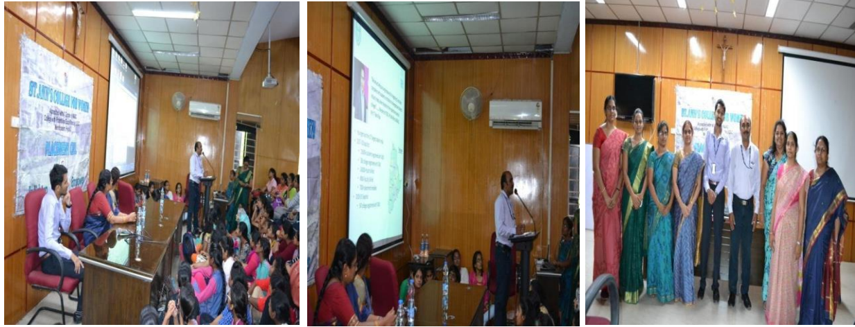
Placements - Dell