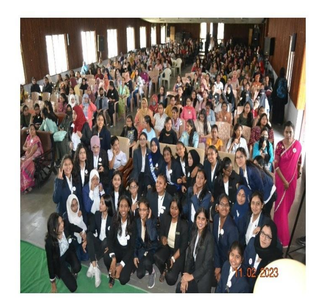
SQAC Team with Alumni