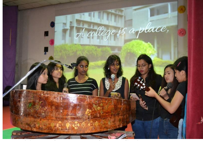
Mesmerising performance by College Choir group