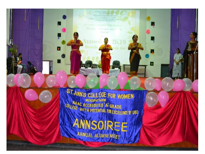
Welcome dance by BBM II year students